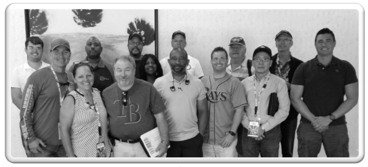
Branch 599's delegates and stewards who attended the 75<sup>th</sup> Biennial State Convention held August 1-3, in St. Petersburg. Eighteen total attended the convention and/or training; several delegates are not pictured.